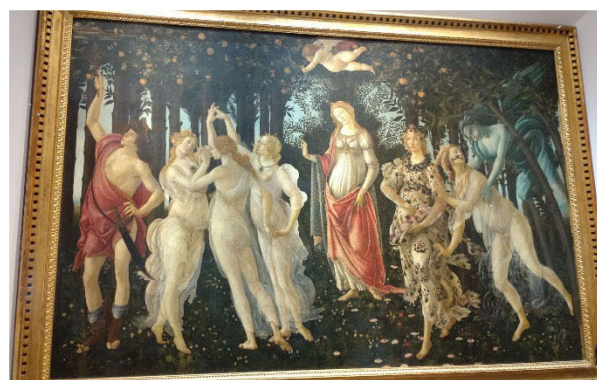
Figure 4 I could encounter numerous works of art.